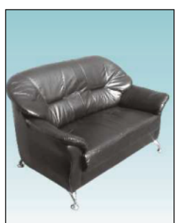
VIP Sofa Double