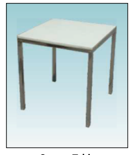
Square Table W D Н 70cm 70cm 70cm