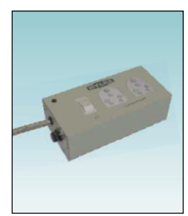
Socket Out Let