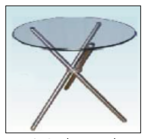
Round Table (Glass top) Dia 90cm 75cm