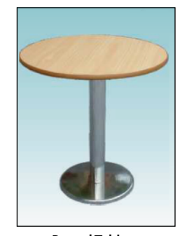
Round Table Dia 70cm 75cm